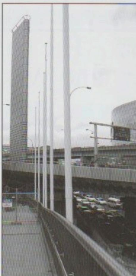
Cross City Tunnel exhaust stack, upper left, at Darling Harbour

Thus the Minister's Conditions of Approval for the Cross City Tunnel gives us the right to insist that the predicted level of traffic be adhered to.