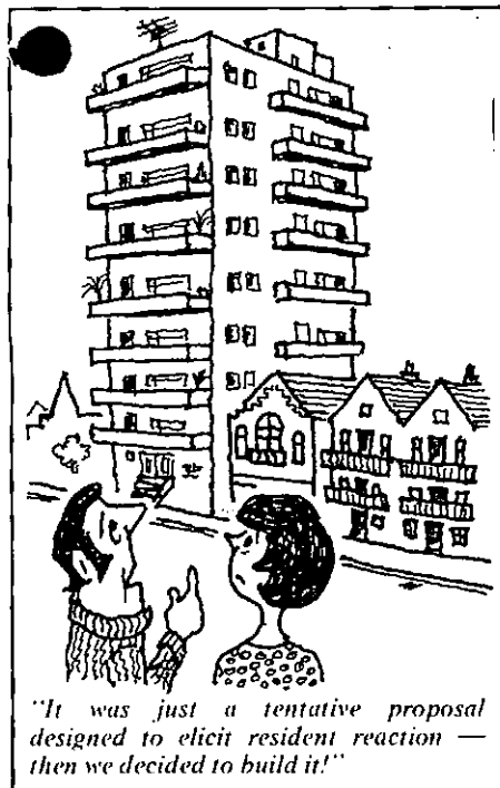
"It was just a tentative proposal designed to elicit resident reaction — then we decided to build it!"